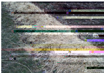
Straw is an effective mulch for annual weed control.

M a a a a d a a a s r r a s . T a s a r r r s a a d s a d s s a s a s d . B a p a s r a a s p a . F p a a s s p a a d a d s r a a s d s a d s d p s p d s p p s s . H s a d s d p s a r r d d s a d p a s . F r r a s s ' M ' s s .