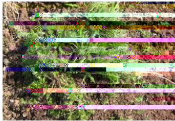
These weeds have been left to die in the sun. Remember that they can quickly re-grow in the right conditions!

a p a s r a s a s a d a s . H r a a a d a a s a s a a d d s a a s a p a s d a r a a s . H a d p a r a s s r d s a a p a s . A d d p a a s r s d a r a s s r p a s . T d d s p a p d s a r a s . H a d p d d s p r a s a s s r a a d p s d a d a a s a r a . H a s p d d a a a d a ' s s d s a d a d r r s p . R a a s s a d s a d s r d s s . l d s a s a d s d a r r a d s a d d a . A s r s r d s d s p d s ' a p a d s a a d d . G a s s a s p a d d r s s s a s p s a p r d d r p . l s a s d s p a a a s a r a s p a r r a d . R d d a d a d r r r a s a s p p s p a d s a d s d s a d a a .