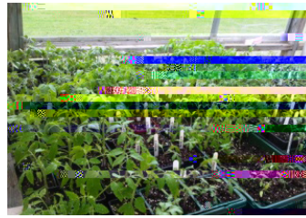
A small, low-cost greenhouse can provide transplants for many gardens.

T ransplants are a great way to start your garden. They are easy to grow and can be started indoors. Transplants are also a great way to save money. They are often sold in bulk and are usually cheaper than starting from seed. Transplants are also a great way to get a head start on your garden. They are already growing and will be ready to go into your garden in a few weeks. Transplants are a great way to get a head start on your garden. They are already growing and will be ready to go into your garden in a few weeks.