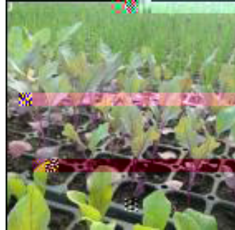
These seedlings are being hardened off in a protected area away from direct sun and drying winds.

H ardening off is the process of gradually acclimating seedlings to outdoor conditions. This is done by exposing the plants to outdoor temperatures and conditions over a period of several weeks. Hardening off is important because it helps the plants to become more resilient to outdoor conditions. This is done by exposing the plants to outdoor temperatures and conditions over a period of several weeks. Hardening off is important because it helps the plants to become more resilient to outdoor conditions.