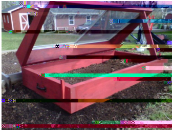
The cold frame lid should be hinged or allow for control of ventilation to conserve heat.

Every cold frame should have a means of ventilation. Ventilation is most critical in the late winter, early spring, and early fall on clear, sunny days when temperatures rise above 7°C. The glazed top should be propped up to allow excess heat to escape or removed entirely. Each day lower or replace the top early enough to conserve some heat for the night.