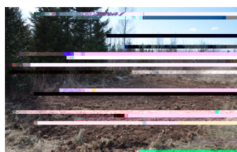
Roto-tilling is usually sufficient for most gardens, and saves labour. However, be careful not to over-till, as this can destroy soil structure.

Fall tilling alone is not recommended for hillside or steep garden plots, since soil is left exposed all winter, subject to erosion when spring rains come. If a winter cover crop is grown to improve soil and prevent erosion, the ground will have to be tilled in the fall to prepare the soil for seed and again in spring to turn under the green manure. Spring cultivation is better for sandy soils and those where shallow tilling is practiced.